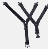
Optional Nomex 4-point with quick-release chinstrap