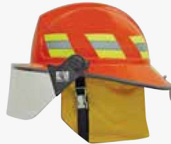
Optional 3 sets of parallelograms Reflexite lime or 3M Scotchlite lime or orange, 2-tone lime or orange