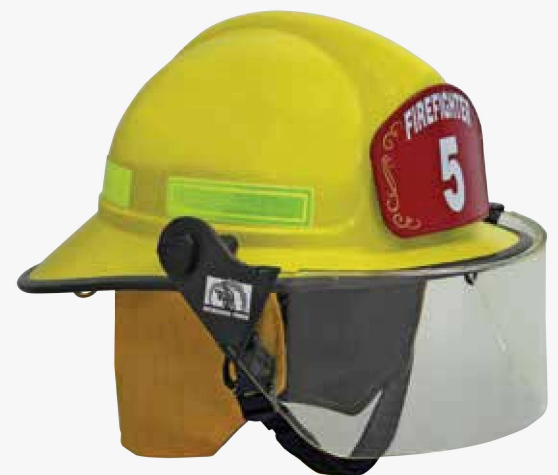
Standard Lite Force LR PLUS HT-LF2-HDO with yellow Nomex FR cotton ear cover

STRUCTURAL MODERN HELMET. NFPA 1971 CERTIFIED.