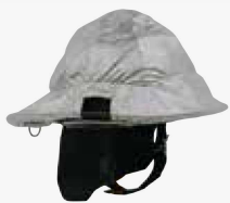
Aluminized PBI cover – recommended for live fire training, not for proximity firefighting