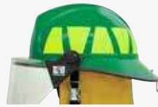
Optional 10 trapezoids Reflexite lime or 3M Scotchlite solid lime or orange, 2-tone lime or orange