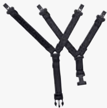
Optional Nomex 4-point with quick-release chinstrap