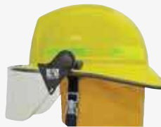
Standard 5 - 1" x 4" bars