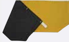
Standard BPR yellow Nomex moisture barrier FR cotton ear cover

(required component) Standard HDO yellow Nomex FR cotton. Optional black PBI® FR cotton (FDNY spec optional material choice). Other outer shell colors available.