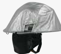
Aluminized PBI cover – recommended for live fire training, not for proximity firefighting