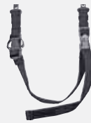
Standard Nomex postman slide and quick-release chinstrap