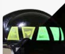
Optional 10 trapezoids Foxfire illuminating