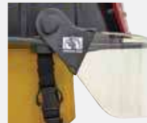
Standard 4" x 0.15" new-generation faceshield