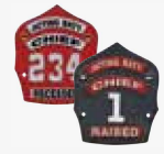
Acting Batt Chief (recessed or raised)