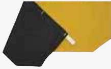
Standard BPR yellow Nomex moisture barrier FR cotton ear cover