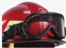
Optional Paulson or ESS NFPA 1971 goggles