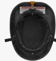
Optional one-piece leather brow comfort cap and ratchet cover