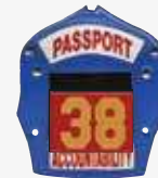
Houston Passport System