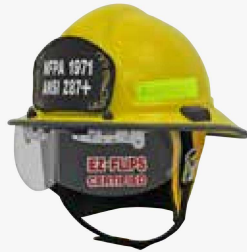
Optional EZ-Flips meets standards of both NFPA 1971 and ANSI Z87.1