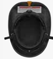
One-piece brow comfort cap