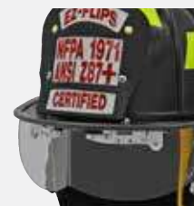
Optional EZ-Flips meets standards of NFPA 1971 and ANSI Z87.1+