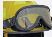
Optional Paulson or ESS NFA 1971 goggles