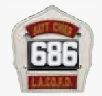
LA County Passport System