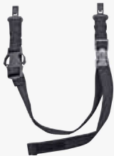
Standard Nomex postman slide and quick-release chinstrap