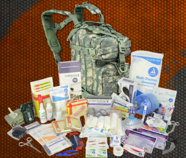
LXPB89 Stocked EMS/EMT Trauma & Bleeding First Aid Responder Medical Backpack Kit