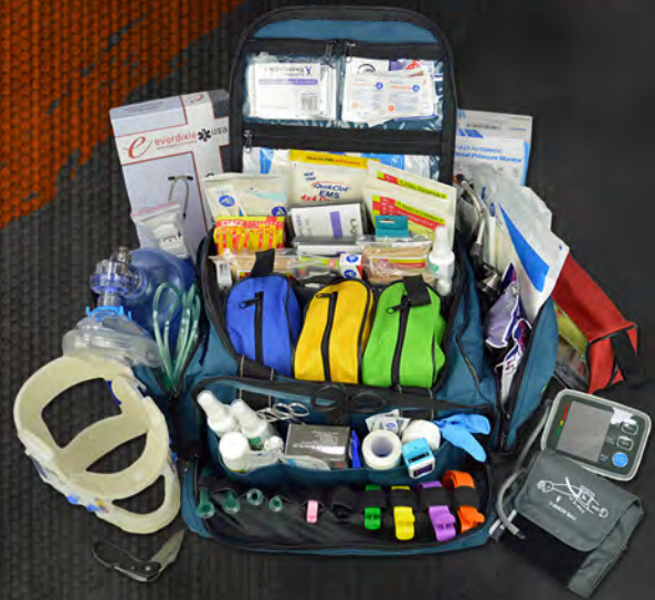
MB35 Modular trauma bag with removable color coded pouches and SMK-F premium fill kit