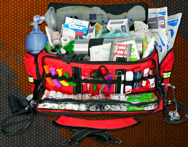
MB50 Deluxe oxygen trauma duffel and SKD advanced fill kit with oxygen cylinder and regulator