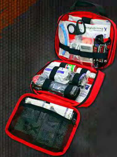
Large Rip-Away IFAK Trauma Bag for Car Head Rest - Laser Cut MOLLE Compatible Pouch