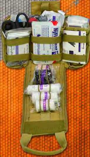
Spread Eagle Complete Tactical Gunshot & Trauma IFAK Kit w/Laser Cut MOLLE.