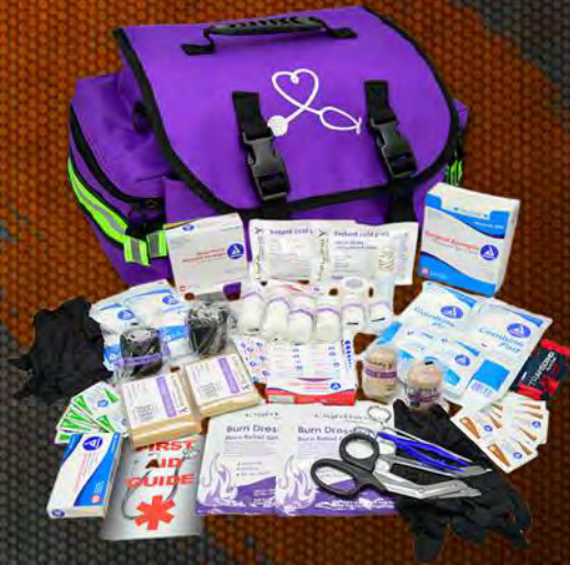
Small Medic First Responder EMT Trauma Bag Stocked First Aid Fill Kit A