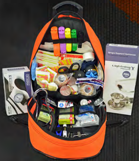
Special Events EMT First Responder Trauma Backpack and Standard Fill Kit