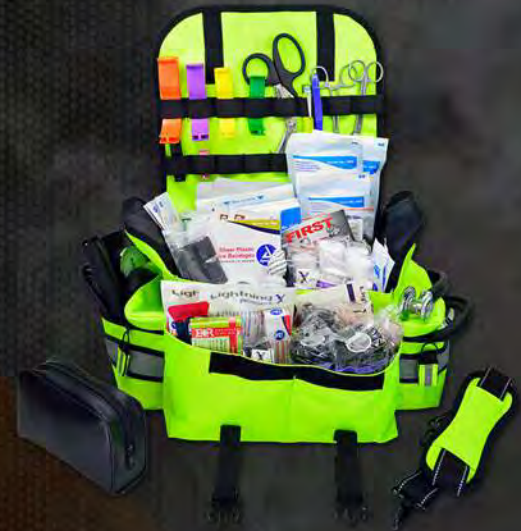
Small EMT First Responder Bag w/ Standard First Responder Fill Kit