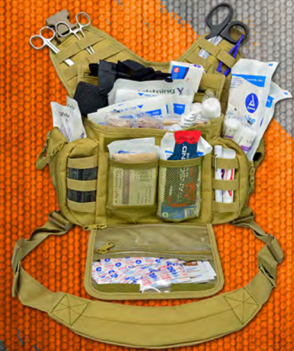
MB15 Tactical shoulder sling pouch and SMK-A basic First Responder Fill Kit