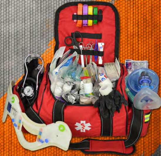
Deluxe Stocked Large EMT First Aid Trauma Bag Fill Kit C and Emergency Medical Supplies