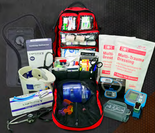
MB45 Tactical modular MOLLE backpack with removable storage pouches and SMK-F premium fill kit with hydration bladder