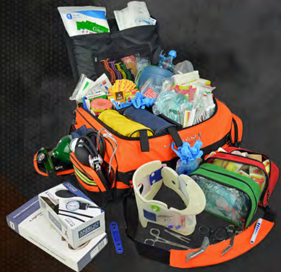
MB65 Modular oxygen trauma bag with removable color coded pouches and SMK-D advanced fill kit with oxygen cylinder and regulator