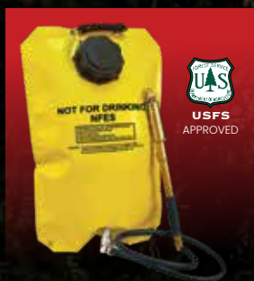
190510 SMOKECHASER with FP100 FIRE PUMP