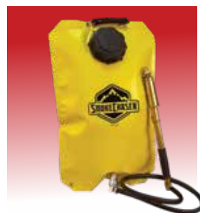
179061V SMOKECHASER with FP100 FIRE PUMP