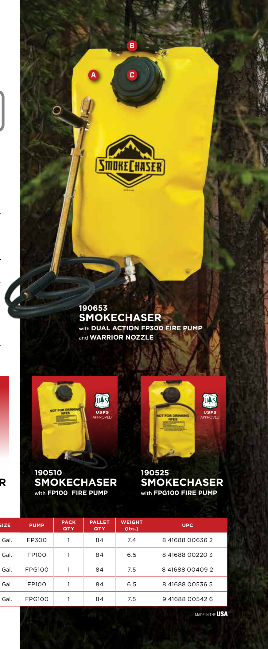
190653 SMOKECHASER with DUAL ACTION FP300 FIRE PUMP and WARRIOR NOZZLE

Premium, Padded Shoulder Straps include clip-on strap to secure the fire pump.