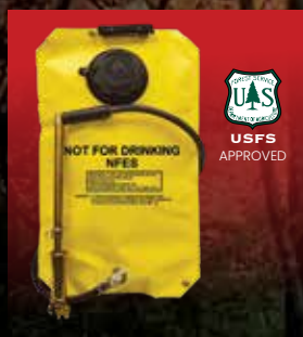
190525 SMOKECHASER with FPG100 FIRE PUMP