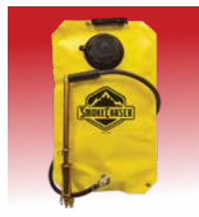
190429 SMOKECHASER with FPG100 FIRE PUMP