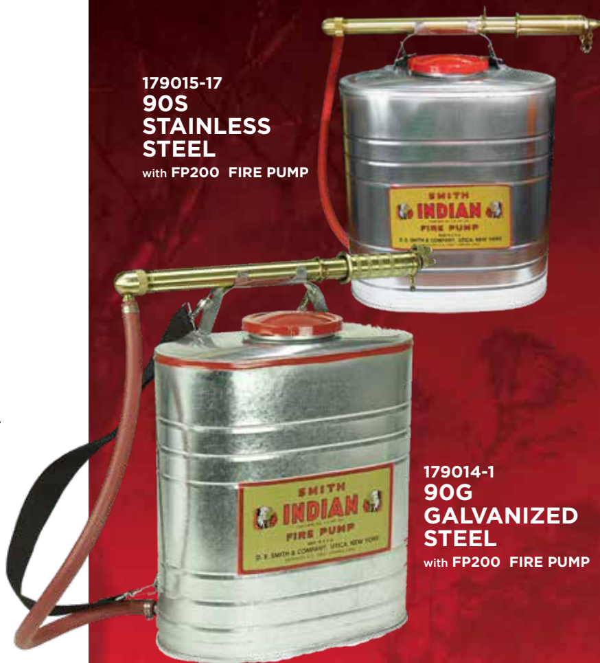
179014-1 90G GALVANIZED STEEL with FP200 FIRE PUMP