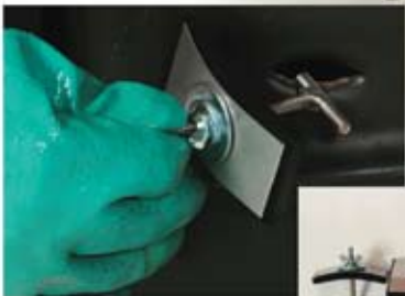
New Offset T Patches for holes & cracks near edge of tank