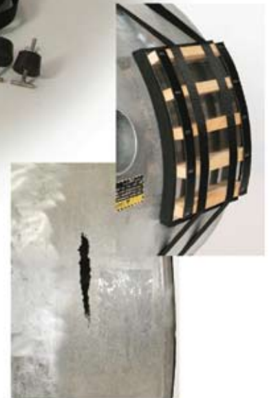
New Ladder Patch with 3/4" foam backing instead of 1/4" hard rubber