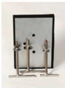
New large Twin T Patch with Offset T-bolts