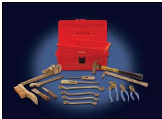
Non-Sparking Tool Kit "G"