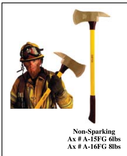
Non-Sparking Ax # A-15FG 6lbs Ax # A-16FG 8lbs