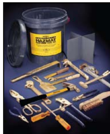
HAZ-MAT Bucket "B-1"