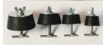
New Taper Surface Plugs with Offset T-bolts

This new universal leak control kit has components to repair punctures, cracks, gashes or surface rotting of all containers, just as our universal kits you may already have. Additionally, this new kit will allow you to patch some holes that previously were more difficult, such as cracks close to the edge of tanks or supports, and cracks that toggle wings will not fit into. All necessary tools and hardware are included.