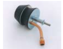
Also Available Separately: 5" "C-1" Plug, 6", 8" and 10" Pipe Plugs

No Complicated procedures are required and no additional tools are needed to utilize these pipe plugs. Because most hazardous material leaks create a potentially life-threatening or property-threatening situation, no emergency response vehicle is fully equipped without Kit "C-1". Also, by containing a problem before it gets out of hand, your staff can save valuable man-hours that might otherwise be spent in full-scale evacuation of an area.