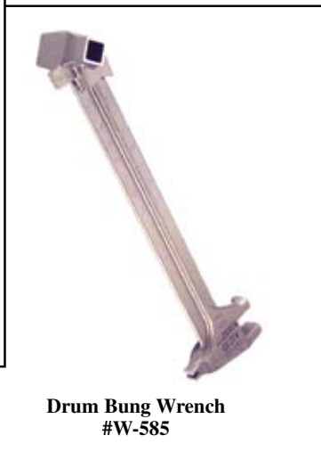
Drum Bung Wrench #W-585